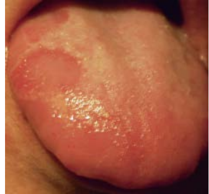
MY TONGUE WITHOUT *****

Later, I learned how to give ***** to myself so I wouldn’t have to go to the doctor’s office so often. That was my first clue that some vitamins can affect your tongue. I also discovered that I needed weekly ***** rather than the monthly ones I was getting from the doctor.